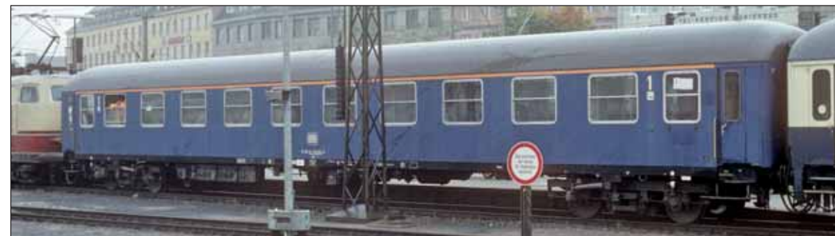
Carrozza DB Tipo X Am 203 di prima classe da 200 Km/h, livrea blu. Passenger car 1 st class type X (Am 203 ) of the DB, 200 Km/h, blue livery. 1.-Klasse-Wagen Typ X (Am 203 ) der DB, 200 km/h, blaue Lackierung.