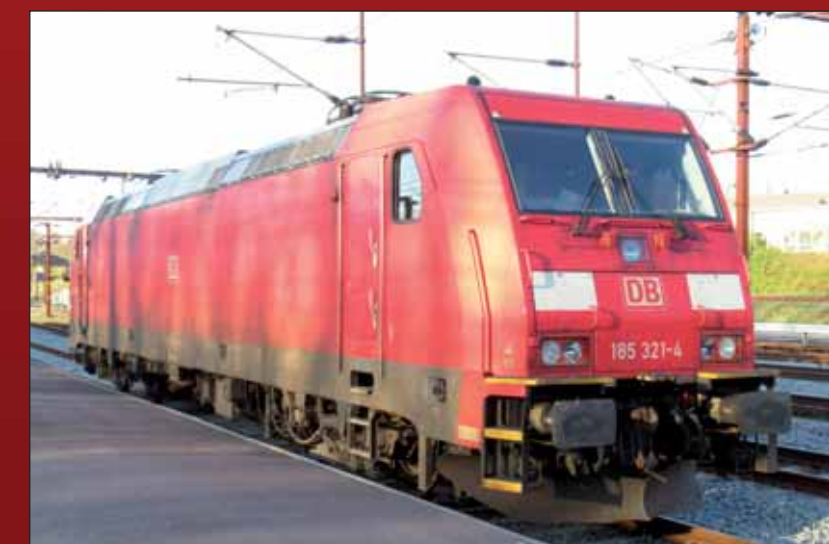
Locomotiva TRAXX 185 321 in livrea rossa "DB", in utilizzo sul corridoio Svezia - Danimarca - Germania.

Lokomotive TRAXX 185 321 in roter „DB“-Lackierung, im Einsatz auf der Strecke Schweden - Dänemark - Deutschland.