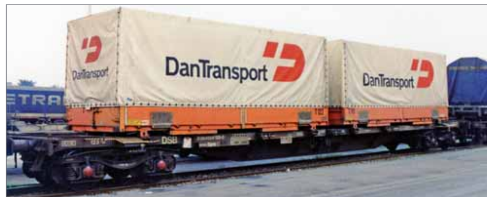
Carro Sgns danese caricato con due casse mobili telonate "DanTransport". Danish type Sgns container wagon loaded with two "DanTransport" swap bodies. Dänischer Sgns-Wagen, beladen mit zwei Planen-Wechselbehältern „DanTransport“.