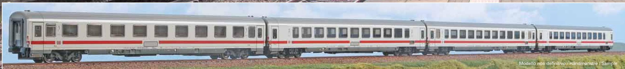
Modello non definitivo / Håndmønstre / Sample