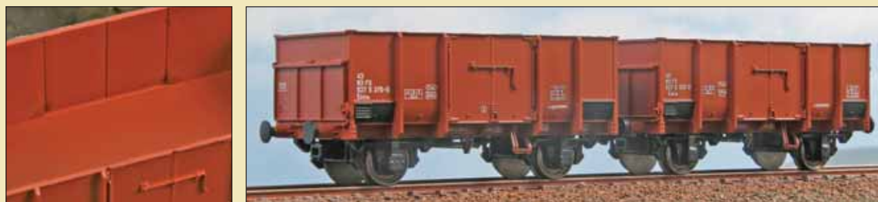
Set di due carri merci FS Tipo Ekklm con fondo di carico in metallo per carichi vari. Set of two FS freight wagons with metal loading floor for various loads. Set aus zwei Güterwagen der Bauart FS Ekklm mit Metallladeboden für verschiedene Ladungen.