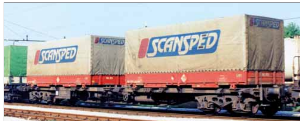
Carro Sgns danese caricato con due casse mobili telonate "SCANSPED". Danish type Sgns container wagon loaded with two "SCANSPED" swap bodies. Dänischer Sgns-Wagen, beladen mit zwei „SCANSPED“-Wechselbehältern mit Plane.