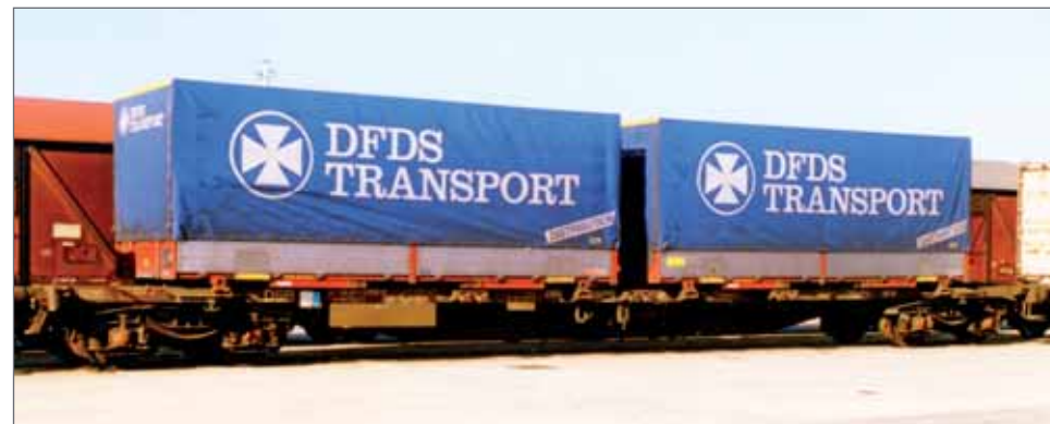
Carro Sgns danese caricato con due casse mobili telonate "DFDS TRANSPORT". Danish type Sgns container wagon loaded with two "DFDS TRANSPORT" swap bodies. Dänischer Sgns-Wagen, beladen mit zwei Planen-Wechselbehältern „DFDS TRANSPORT“.