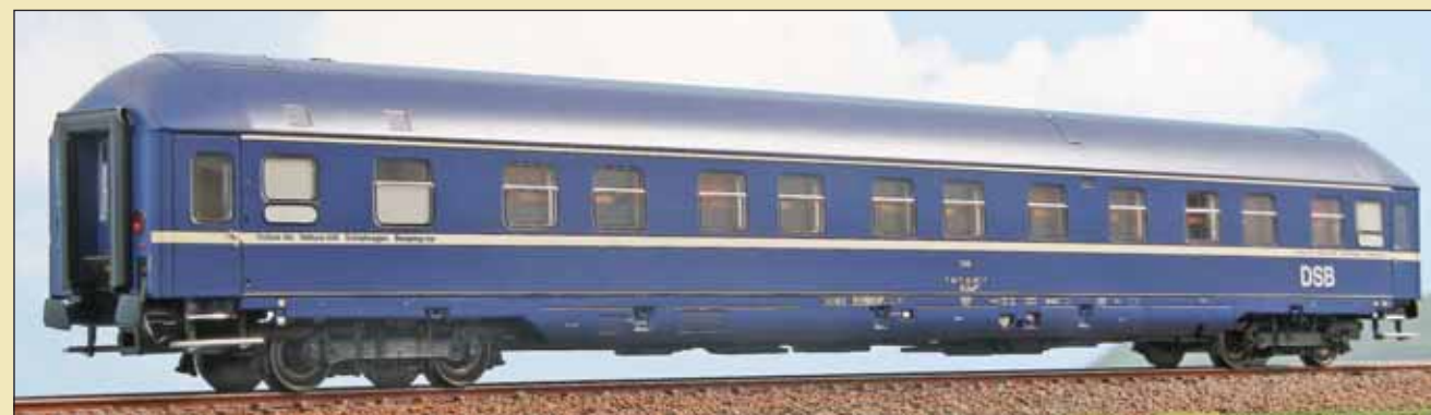
Carrozza letti Tipo WLABmh 174 delle DSB in livrea blu TEN Sleeping car 2 nd class type WLABmh 174 of the Danish Railways in TEN blue livery. Schlafwagen Bauart WLABmh174 der DSB in blauer TEN-Lackierung.